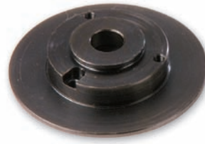
Heavy duty, precision bearing races