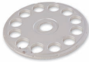
Precision machined, industrial strength aluminum lens dials