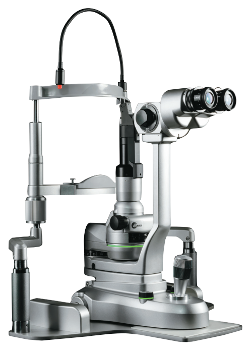
462mm h x 484mm w (front) 462mm h x 329mm w (side)

A complete line of custom Ultra M4 accessories are also available.