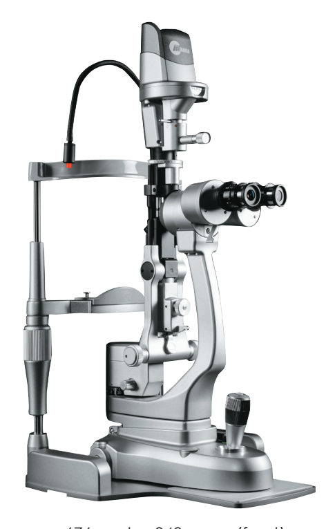
676mm h x 348mm w (front) 676mm h x 369mm w (side) [420mm to optics]

A complete line of custom Ultra M3 accessories are also available.