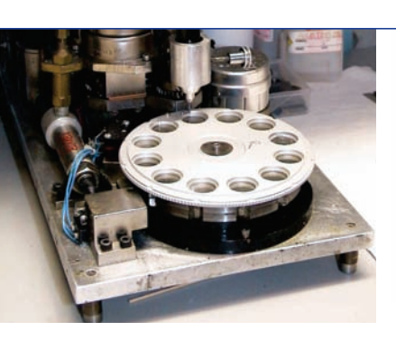
Lenses secured by highly precise automated adhesive dispensers